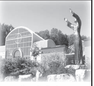
Pre-plan today... for peace of mind tomorrow.

Meeting 3rd Thursday of Each Month at 683 McEwan Ave. Call 519-999-0927 uknight.org/CouncilSite/?CNO=14969